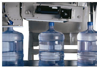
BOTTLED WATER FILL LINES