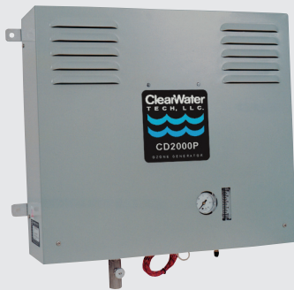
CD2000P Ozone Generator