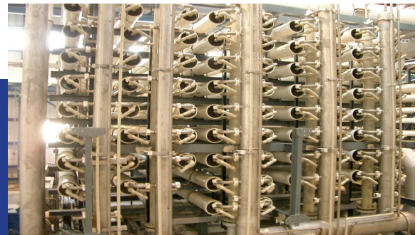
Fujairah, U.A.E. SWC Installation 45 MGD (170,000 m 3 /d.)

SWC4+, SWC4+B (high boron rejection), SWC4+Max (high flow, rejection and boron rejection), SWC4+B Max, SWC5 (8" and 16"), SWC5-LD, SWC5 Max (high flow, rejection and boron rejection), SWC6.